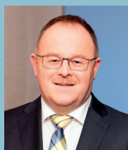
Romain Schneider Minister for Development Cooperation and Humanitarian Affairs

Luxembourg Development Cooperation created the Business Partnership Facility to support this new momentum and strengthen the role of the private sector in the implementation of inclusive growth in developing countries. Together we create innovative partnerships that simultaneously benefit our companies and those in developing countries.